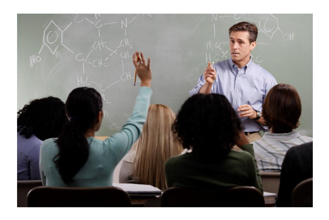
How do I find a thesis director? How do I find a faculty reader?

The easiest way is to approach a faculty member you enjoyed working with, on a topic that you want to continue studying, and ask them if they would be available to continue working with you. Many faculty members have directed honors theses at DePaul. If a faculty member doesn't immediately come to mind, you can consult the list of Recent Thesis Directors/Faculty Readers that is included in your Thesis Packet.